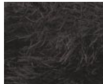
Detail of Yarn